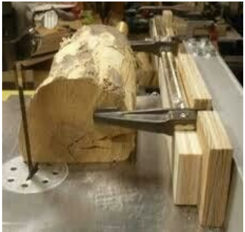
Slabbing on the bandsaw