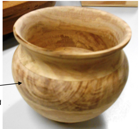
Perrie Purple Heart & Leather wood