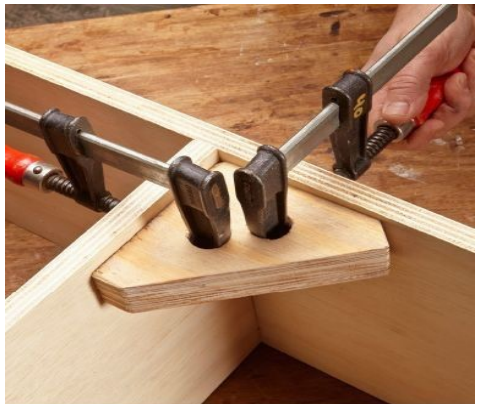
RIGHT-ANGLE CLAMPING JIG Here's a little helper that you can make in about two minutes. It's like a third hand for holding cabinet parts together for assembly, or for clamping miter joints.

PowerUpHandyman.com 800-765-8888 JAN 16, 2017 14