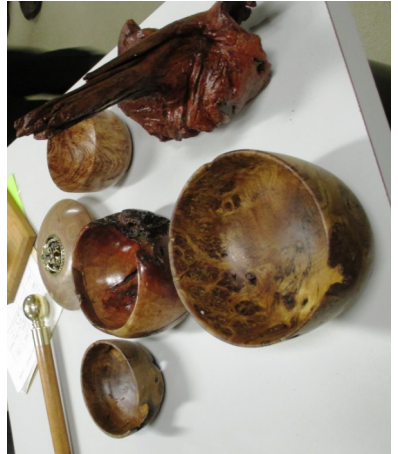
↑ Baden Howe ( show & Tell )