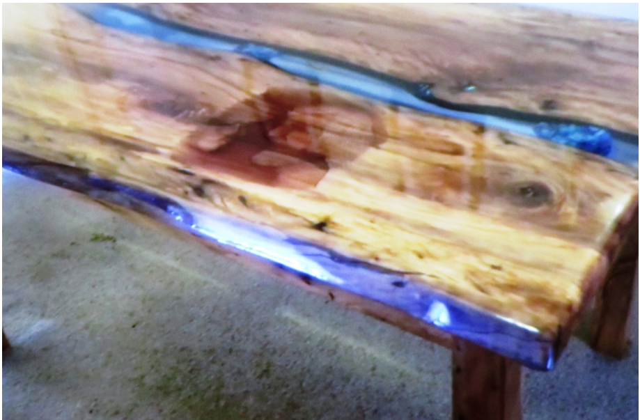
Bob Beecroft ( Show & Tell ).