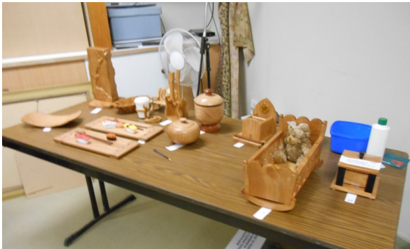
Annual Meeting Silky Oak Comp