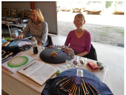
Kyabram Lace Ladies