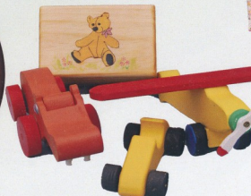
Selection of wooden toys