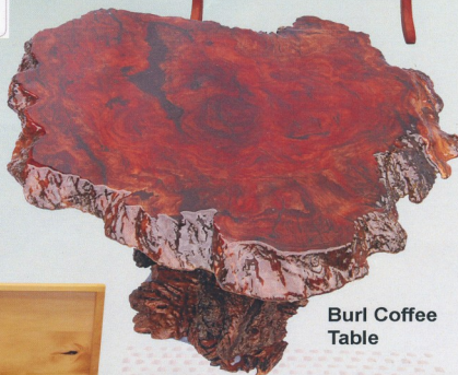
Burl Coffee Table