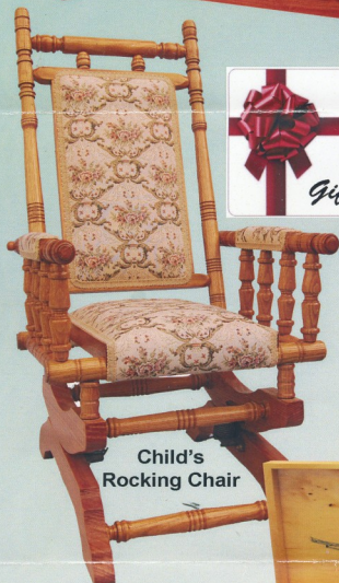
Child's Rocking Chair