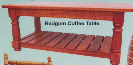
Redgum Coffee Table

Sunday 12th March at Eastbank, Shepparton