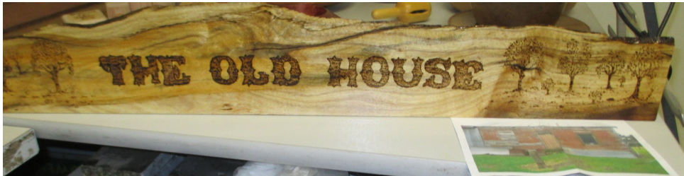
House sign by Norma Harrison. Timber: Blackwood. Pyroed. Finish: Wipe on Wipe off.