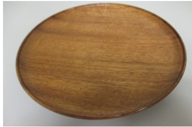
4 Bowls & 2 Platters by Ray McDonald Timber: Various Finish: French Polish