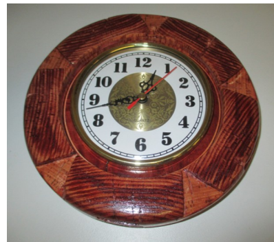
Clock by Baden Howe. Timber: Tasmanian Ash Finish: Estapol. Jarrah Stain.