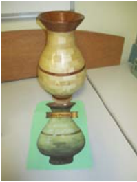
Don McCrabb Segmented vase: Golden Poplar, Estapol.