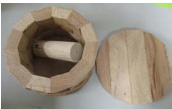
Geoff Pinkerton 'Unfinished' Silk Oak