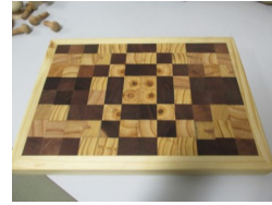
Peter Meddings: Cutting boards