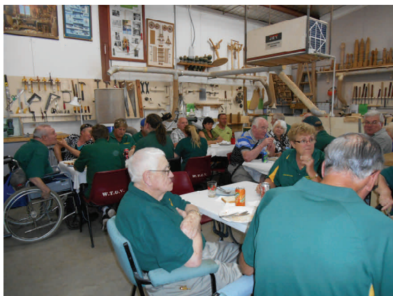
SATURDAY NIGHT 8TH