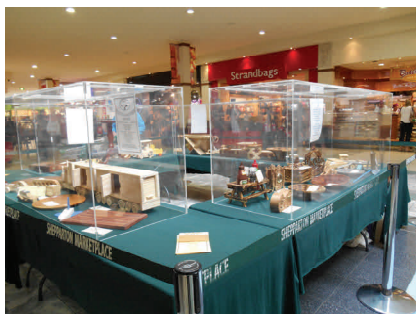
MARKET PLACE DISPLAY

W.T.G.V. WEBSITE - www.woodturnersgv.com Our newsletter can be seen in colour on website.