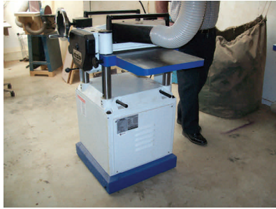
THE CLUB'S TWO NEW MACHINES